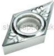
Figure- 1 cutting tool AK10 Carbide insert

AK10 Carbide Inserts for Turning Ground and Polished for Aluminium Uni-tip was used for turning.