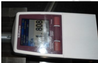
Figure- 2 Surface roughness Tester SJ-210

The Surface roughness tester used for measuring surface roughness (Ra) in this experimental analysis is given below